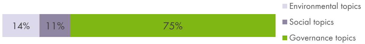
Chart 1: Thematic allocation of dialogs